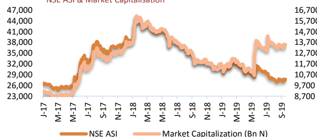
NSE ASI & Market Capitalisation

The Nigerian equities market journeyed further into the negative territory by 0.84% as investors were bearish on most consumer goods stocks, even as the Bourse registered 18 gainers as against 12 lagers at the close of trade today. Hence, the year to date performance of the ASI slid further into the red zone, 13.82% from 13.09%. Symbols such as NESTLE, UACN, GUINNESS, HONYFLOUR and OANDO plummeted by 9.99%, 3.57%, 3.24%, 1.00% and 1.60% respectively. Meanwhile, the total volume of equities traded plummeted by 9.67% to 175.78 million units while the total value fell by 16.18% to N2.57 billion. Elsewhere, NIBOR rose across tenure buckets amid renewed liquidity squeeze; however, NITTY dipped for most maturities tracked amid sustained bullish activity in the secondary treasury bills market. In the bonds market, the values of OTC FGN papers were flattish for most maturities tracked; however, FGN Eurobond values contracted across maturities tracked amid sustained sell-offs in the international bond market.